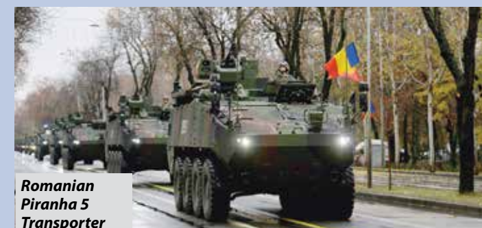
Romanian Piranha 5 Transporter