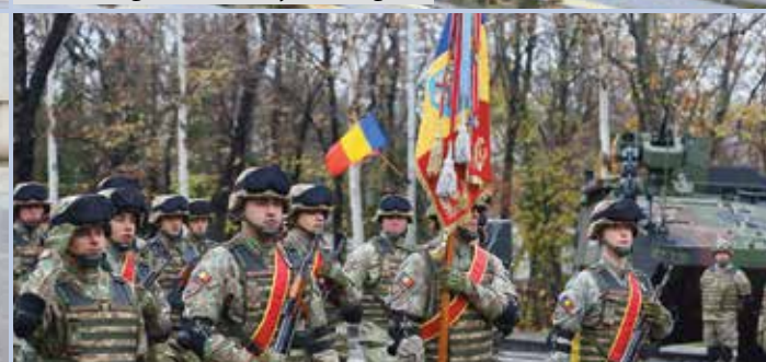
Romanian Air Force Detachment