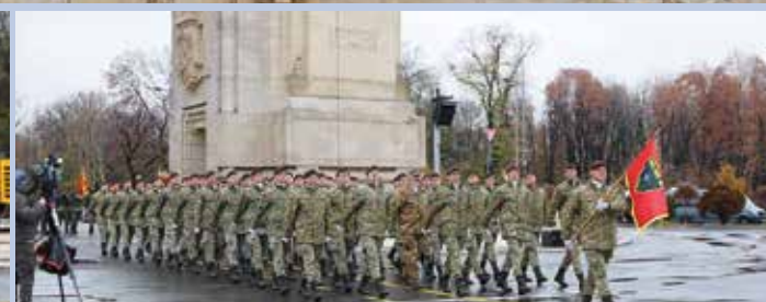
Multinational Brigade South East Detachment