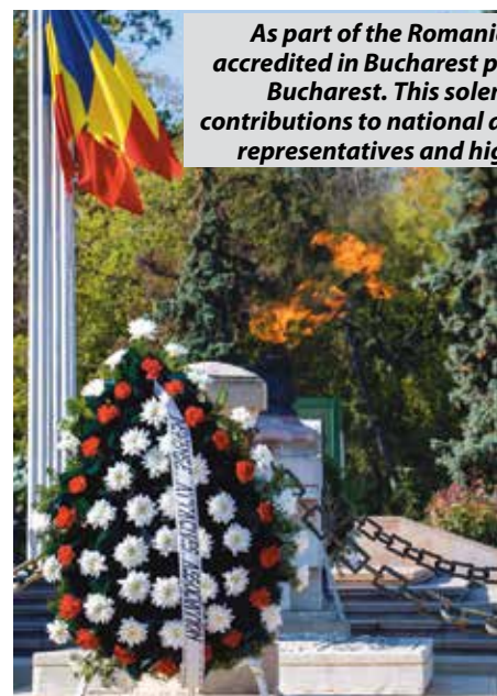
As part of the Romanian Armed Forces Day commemorations on October 25, members of the military attaché corps accredited in Bucharest paid their respects by laying a wreath at the Monument of the Unknown Soldier in Carol I Park, Bucharest. This solemn gesture underscored the enduring respect and recognition of the Romanian Armed Forces' contributions to national and international security. The wreath-laying ceremony symbolized solidarity among military representatives and highlighted the shared values of honor, sacrifice, and unity that bind allied and partner nations.