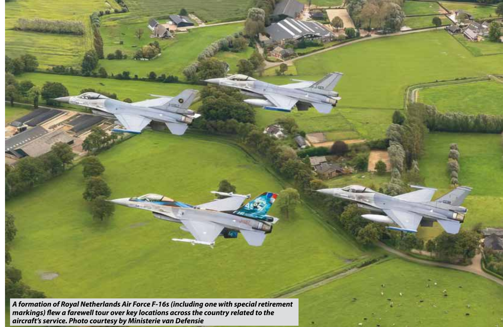
A formation of Royal Netherlands Air Force F-16s (including one with special retirement markings) flew a farewell tour over key locations across the country related to the aircraft’s service.

On November 26, in a ceremony at Albacete, Portugal acceded to the TLP and became the eleventh member to contribute to the programme.