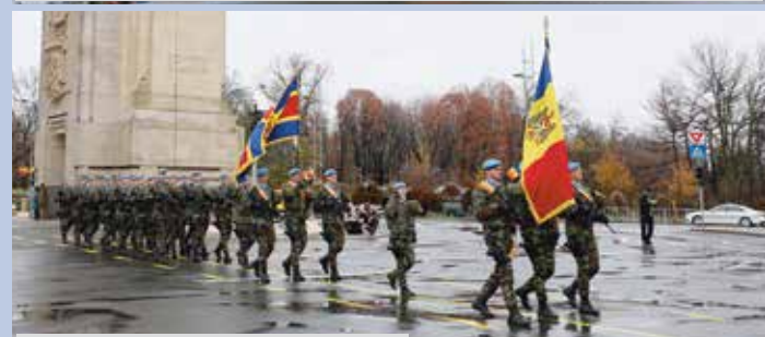
Republic of Moldova Detachment