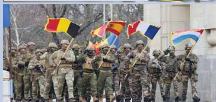
Forward Land Forces (FLF) Multinational Battlegroup