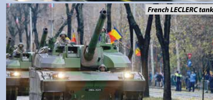
French LECLERC tank