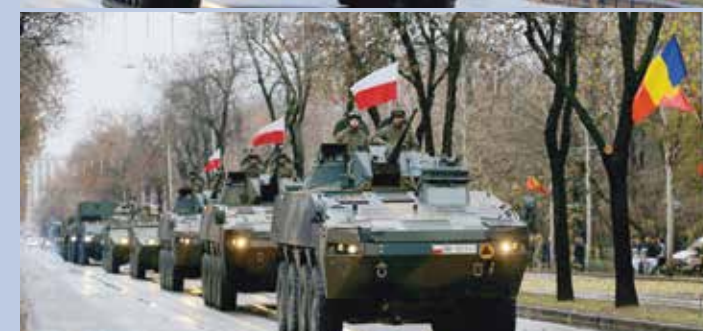
Polish KTO Rosomak

This year's National Military Parade was more than a celebration of national unity and pride; it showcased Romania's steadfast commitment to the shared values of the North Atlantic Alliance. In a symbolic moment, Romania looked confidently toward the future, marking 20 years of NATO membership with a parade that reflected the professionalism of its military personnel, the strength of its partnerships with allied nations, and an unwavering drive for progress.