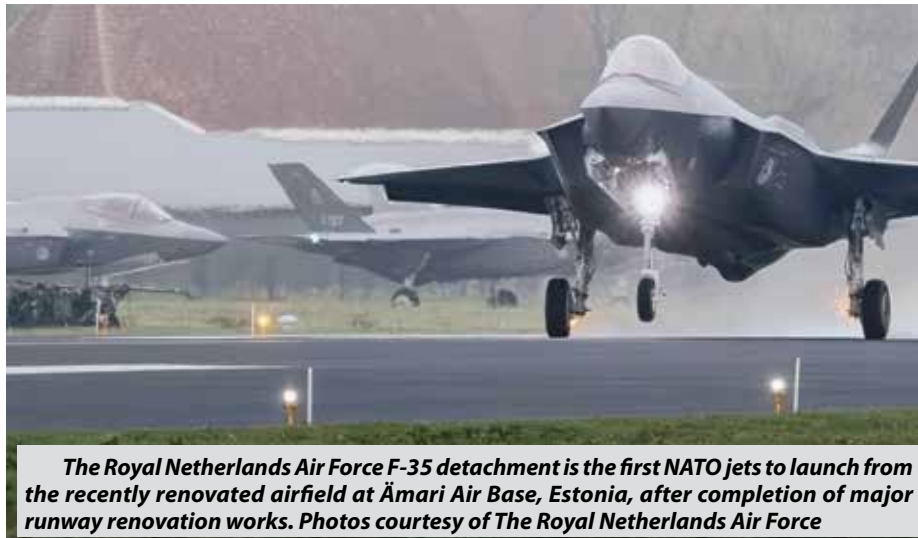
The Royal Netherlands Air Force F-35 detachment is the first NATO jets to launch from the recently renovated airfield at Ämari Air Base, Estonia, after completion of major runway renovation works.

Providing a set of F-35s for this NATO mission is another major contribution the Netherlands make to collective security in the region – already in 2023, a Dutch F-35 detachment was deployed to Malbork, Poland, and supporting