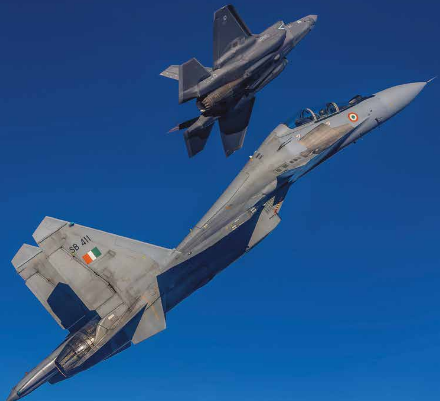
A photo that has somewhat become a symbol of Exercise Pitch Black: an Su-30 belonging to the Indian Air Force flying alongside an F-35B from the Marina Militare. The type or origin of the aircraft becomes less significant when the focus is on the shared mission of ensuring peace and stability in the region; it was an exercise which saw the participation of 20 countries, Italy, Australia, France, Germany, India (with 6 Sukhoi SU-30MK1), Indonesia, Japan, Malaysia, Philippines with the brand new FA-50), Papua New Guinea, Republic of Korea, Singapore, Spain, Thailand, UK, USA, Brunei, Canada, Fiji, New Zealand