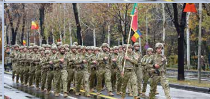
The Portuguese Military Contingent