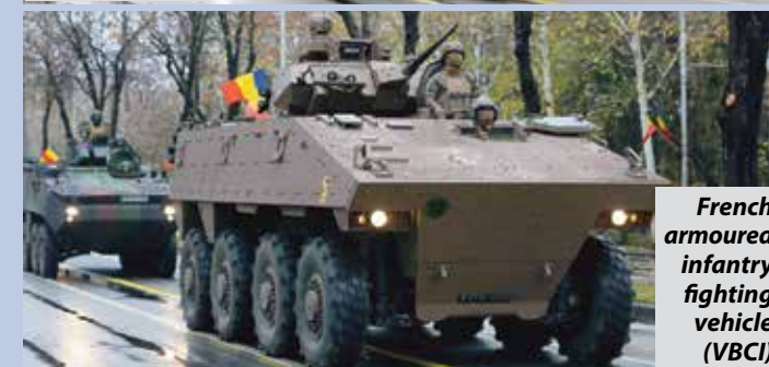
French armoured infantry fighting vehicle (VBCI)