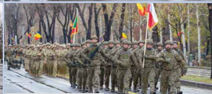
The Polish Military Contingent