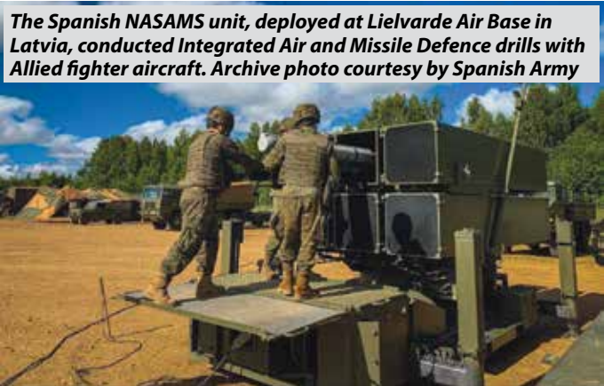
The Spanish NASAMS unit, deployed at Lielvarde Air Base in Latvia, conducted Integrated Air and Missile Defence drills with Allied fighter aircraft.