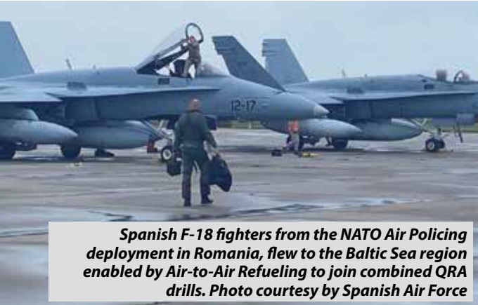
Spanish F-18 fighters from the NATO Air Policing deployment in Romania, flew to the Baltic Sea region enabled by Air-to-Air Refueling to join combined QRA drills.

This exercise series underscores among NATO members. NATO's commitment to collective defense, integrating multiple fighters and support aircraft for a robust demonstration of readiness, interoperability, and cooperation reinforce regional security.