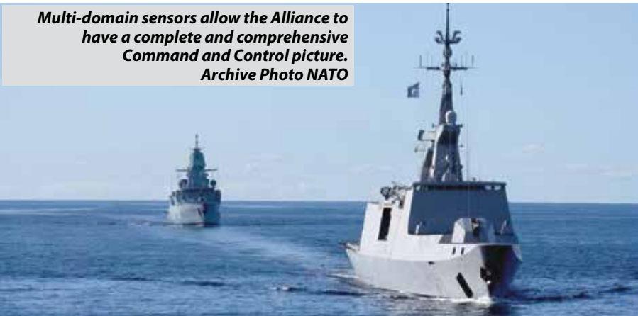
Multi-domain sensors allow the Alliance to have a complete and comprehensive Command and Control picture.

In support of these efforts, an Italian Conformal Airborne Early Warning (CAEW) aircraft was recently controlled by NATO to provide airborne surveillance, command, control, and communications in the region as part of a concerted NATO enhanced Vigilance Activity (eVA) to assure Allies and enhance readiness. The activities of the Italian aircraft in the region also demonstrate NATO's interoperability and its swift ability to integrate with maritime assets, staging effective and cohesive multi-domain sensors anywhere and everywhere on NATO territory. Multi-domain sensors allow the Alliance to maintain a complete and comprehensive Command and Control (C2) picture. "There's no point in having great capability – fighters, air defense missile systems, radars, and munitions – if you're unable to ensure they're employed effectively," said General James Hecker, AIRCOM Commander. "This requires an appropriately designed Air Command and Control systems approach, which allows us to direct our critical air assets at the moment of most need," General Hecker added. AIRCOM provides scoped and effective air detection capabilities for the Alliance, integrating assets with NATO maritime and land assets. Robust multi-domain sensors allow the Alliance to maintain an accurate air picture, providing AIRCOM, the Baltic States, and Poland with situational awareness to identify and report any possible air incursions or violations.