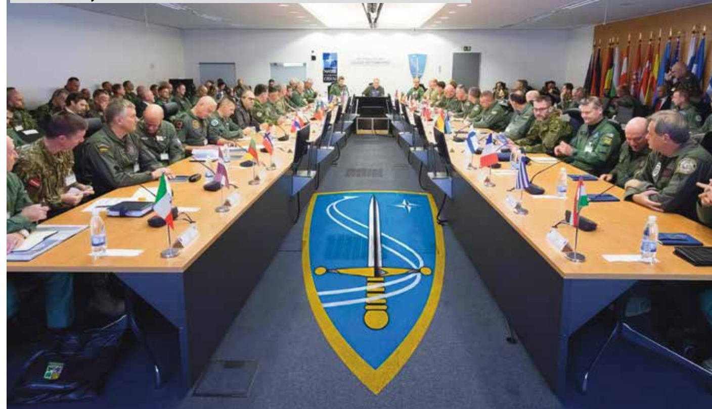
Senior leadership from Allied and Partner air forces convene to discuss NATO Air Command and Control.