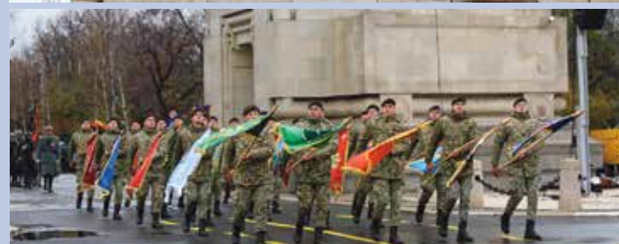
The Detachment of flag bearers representing the structures that participated in the Theaters of Operations