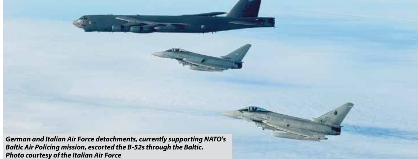
German and Italian Air Force detachments, currently supporting NATO's Baltic Air Policing mission, escorted the B-52s through the Baltic.

U.S. B-52 Stratofortress bombers assigned to the 20 th Expeditionary Bomb Squadron integrated with NATO Allies in executing Bomber Task Force 25-1, exercise Vanguard Merlin at Cudgel Range, Lithuania, Nov. 14-15, 2024. Multilateral exercises serve as visible symbols in support of assurance and deterrence objectives to NATO Allies and partners. These exercises also provide valuable opportunities to synchronize and operate as a cohesive alliance that is ready and postured.