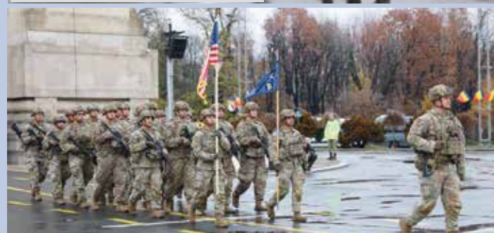
10 th Mountain Division, United States Army