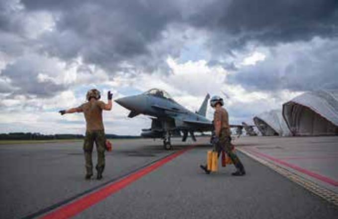
German Eurofighters flying out of Lielvarde AIR Base, Latvia, have safeguarded the Baltic Air Space under NATO orders since March 2024.

Defense (GBAD) exercises. In this multinational training environment, the Spanish National Advanced Surface-to-Air Missile System (NASAMS) GBAD unit, deployed at Lielvarde Air Base in Latvia, conducted Integrated Air and Missile Defense drills in coordination with Italian and German Eurofighter aircraft. Controllers at the Baltic nations' Control and Reporting Centers provided essential tactical control for fighter maneuvers, also directing air-to-air refueling of fighter jets by an A-330 MRTT from the Multinational MRTT Unit based at Eindhoven, the Netherlands. Allied Air Command and NATO's Combined Air Operations Center at Uedem, Germany, conduct Ramstein Alloy exercises three times annually, offering in-place Baltic Air Policing detachments valuable training with regional air forces.